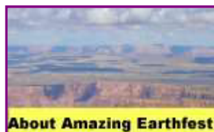
About Amazing Earthfest