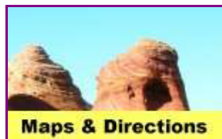
Maps & Directions